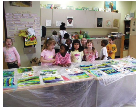
Public School 479 invites a local artist to teach their class.