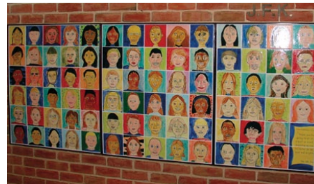
Public School 479 invites a local artist to teach their class.